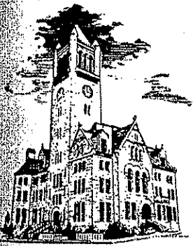
Fayette County Courthouse